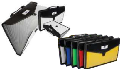
SAGA EXPANDING FILE