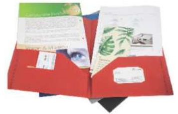
SVS PRESENTATION FILES