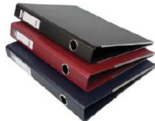
SVS RING BINDER (PVC)