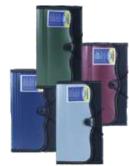
SAGA: CHQ-O EXPANDING FOLDER