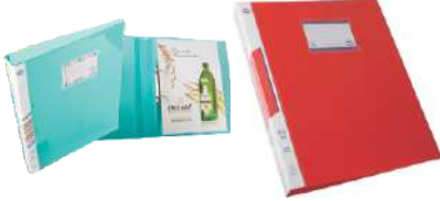
SAGA RING BINDER