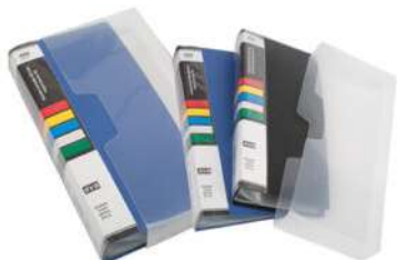
SVS VISITING CARD ALBUMS