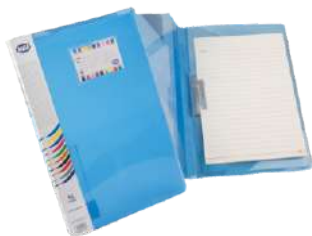
SAGA LEVER CLIP FILE