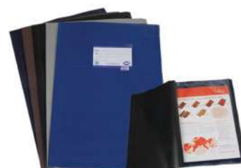
SVS LAMINA FOLDER FILE