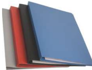
SVS ECONOMY CONFERENCE FOLDER