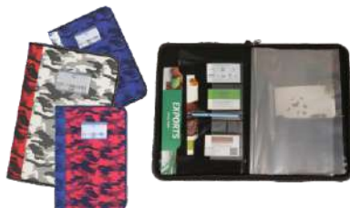
SAGA DELTA CHAIN BAG FILE