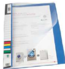
SVS PROJECT REPORT FILES