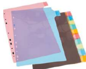
SVS INDEX SEPARATOR