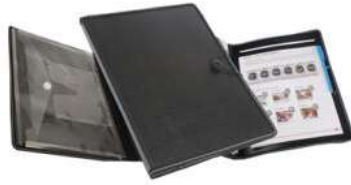
SVS CONFERENCE FOLDER