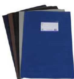
SVS DOUBLE LAMINA FILE