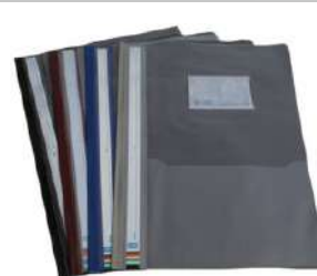
SVS LAMINA MORACCO FILE