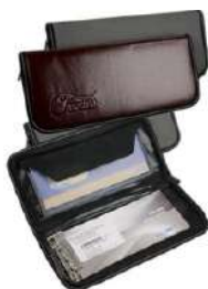
SVS CHEQUE BOOK HOLDER