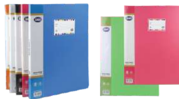
SAGA CLEAR BOOKS