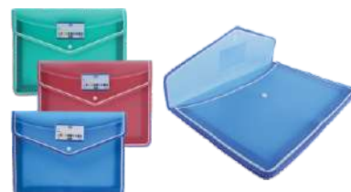
SAGA EXPANDABLE BUTTON BAG