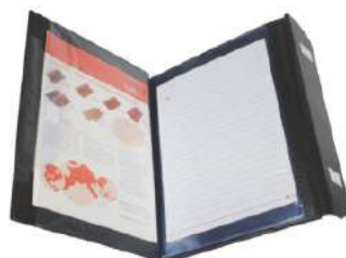
SVS 8G VELCRO FILE