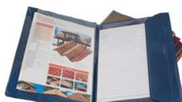
SVS 6G TT VELCRO FILE