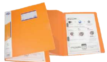
SAGA DELUXE CLIP FILE