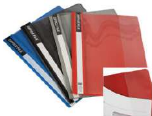
SVS OFFICE FILES