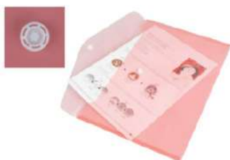
SVS MY CLEAR BUTTON BAG