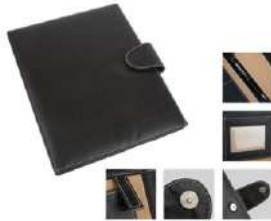
SVS CONFERENCE FOLDER