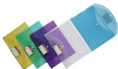
SAGA BUTTON BAGS (CROSSLINE)