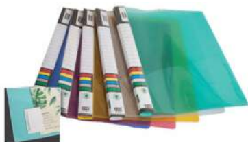
SVS REPORT FILES