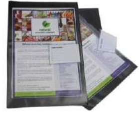
SVS LAMINA MORACCO L - SHAPE FOLDER