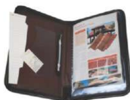
SVS NATIONAL PERMIT