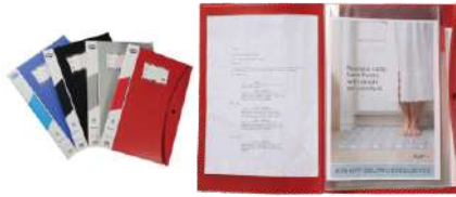
DISPLAY FILE WITH PUNCH LESS CLIP