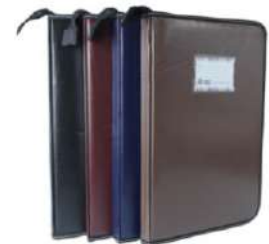
SVS ECONOMIC CHAIN BAG