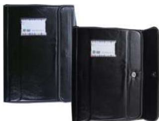
SVS ECONOMIC MAGNETIC FILE