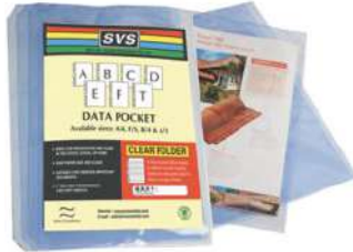
SVS PUNCH FOLDERS