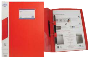
SAGA SPRING CLIP FILE