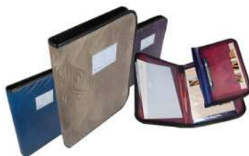
SVS EXCELLENT FILE