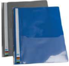
SVS RIGID CLEAR FILE