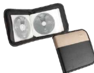
SAGA CD WALLETS