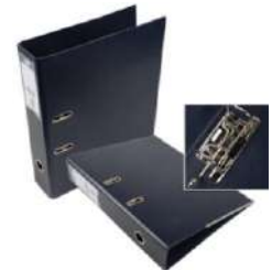
SVS LEVER ARCH FILE (PVC)