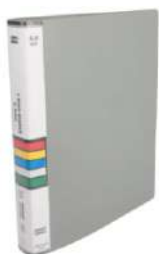
SVS RING BINDER