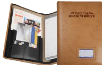
SAGA EXECUTIVE DOCUMENT HOLDER