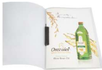
SVS SWING GRIP FILES