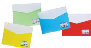
SAGA BUTTON BAGS