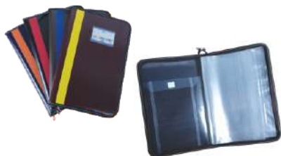
SAGA CLASSIC CHAIN BAG FILE