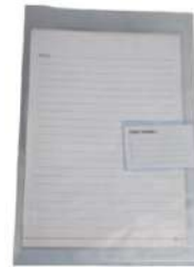
SVS MORACCO L - SHAPE FOLDER