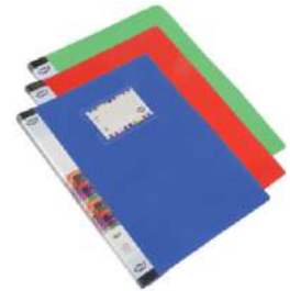
PREMIUM REPORT FILE