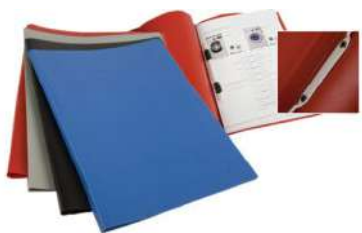
SVS SOFTY CLIP FILE