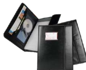
SAGA PREMIUM MAGNET FILE