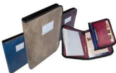
SVS EXCELLENT FILE