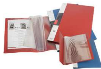
SVS DISPLAY FILES