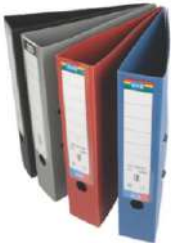
SVS LEVER ARCH FILE