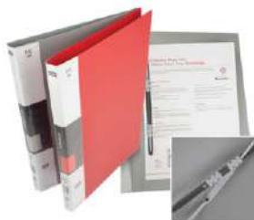
SVS CLIP FILES