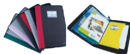
SAGA ICONIC CHAIN BAG FILE