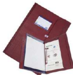
SVS A-1 VELCRO FILE