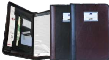
SAGA PREMIUM CHAIN FILE