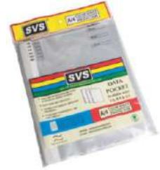
SVS SHEET PROTECTOR