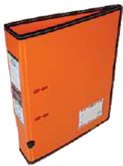
SAGA LEVER ARCH FILE