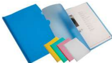
SVS STRIP FILES