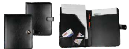
SAGA CONFERENCE FOLDERS