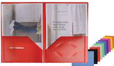
SAGA PRESENTATION FOLDER