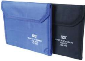
SVS VEHICLE DOCUMENT FOLDER