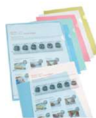
SVS PPL SHAPE FOLDERS