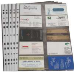
SVS CARD HOLDER INNERS