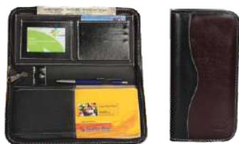
SAGA CHEQUE BOOK HOLDER