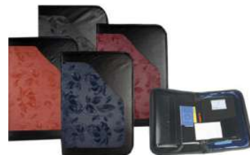
SVS PVC CHAIN FILES