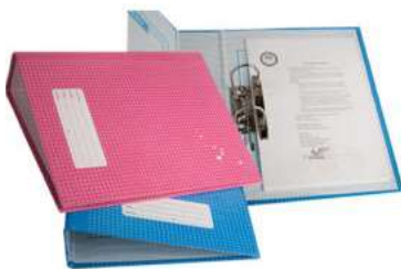
SVS LAMINATED LEVER ARCH FILE